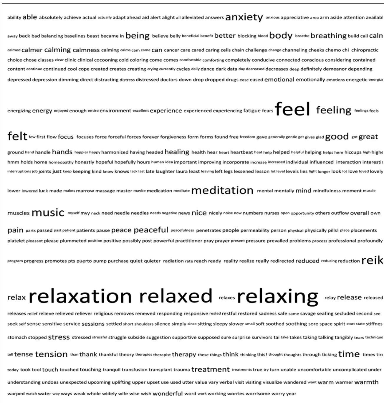
Figure 2. Word cloud: Patient experience of Reiki.

caregivers, staff) physically, emotionally, and spiritually. In this article, we analyzed data collected as part of an evaluation of a Reiki volunteer program in a large, urban academic cancer center. We found that even by a conservative estimate, 82.6% of individuals who received Reiki had positive experiences. Reiki produced clinically meaningful and statistically significant short-term reductions in distress, anxiety, depression, pain, and fatigue. Qualitative data suggests that Reiki evoked a relaxation response for many